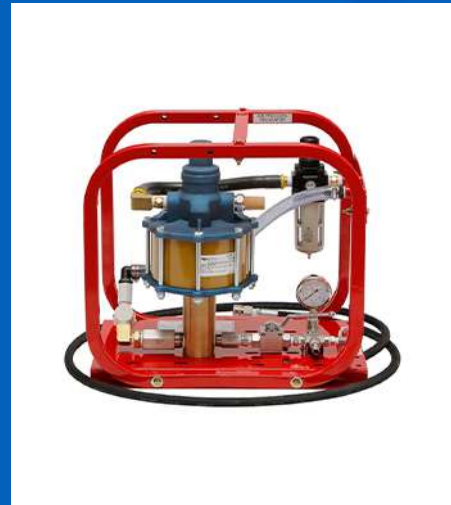
High Pressure Pneumatic