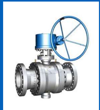
Trunnion Ball Valves