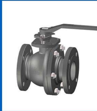
Floating Ball Valve