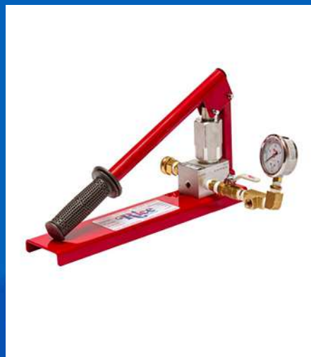
Manual Hand Operated Hydrostatic Test Pumps