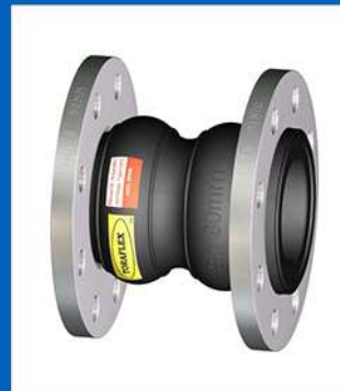
S20 Double Sphere Expansion Joints