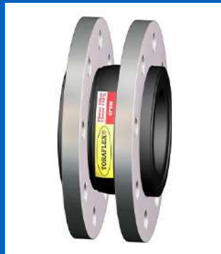
S15 Single Sphere Expansion Joints