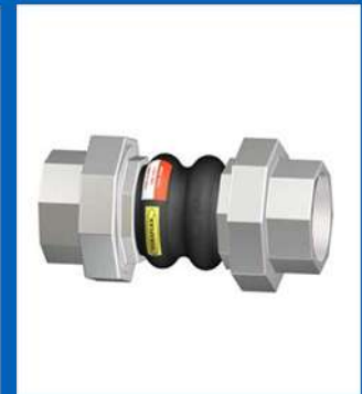
S30 Threaded unions Expansion Joints