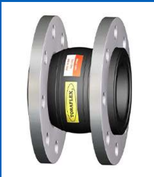
S10 Single Sphere Expansion Joints